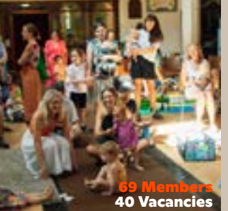
KIDS & HEY BABY CREW