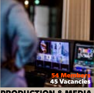
PRODUCTION & MEDIA