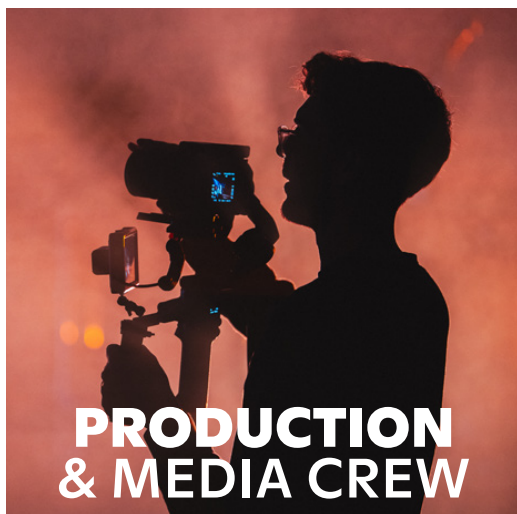
PRODUCTION & MEDIA CREW

We have 7 CREWS with 473 members that make everything we do possible. To fulfil our vision, we need 328 more volunteers to serve!