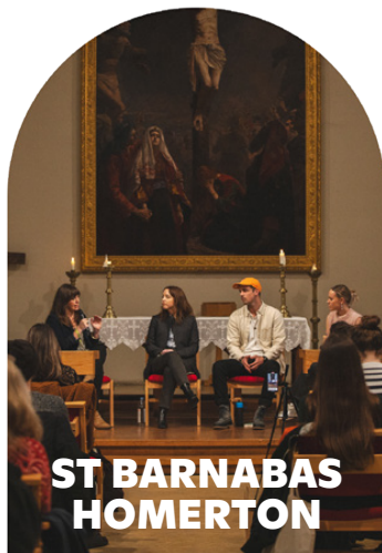
ST BARNABAS HOMERTON

14 SERVICES EACH WEEK ACROSS EAST LONDON