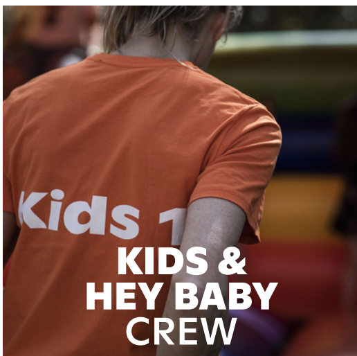
KIDS & HEY BABY CREW