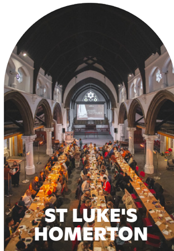
ST LUKE'S HOMERTON