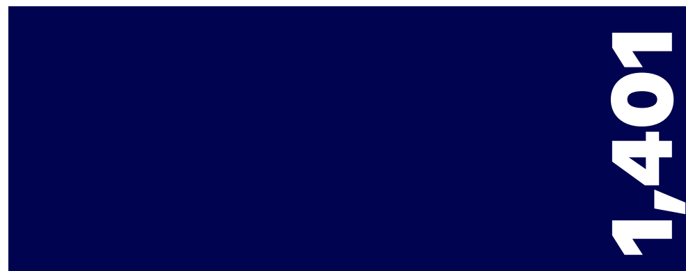
Average Sunday attendance, December 2023